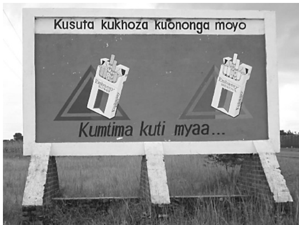
Figure 2 Mixed messages. “your heart is contented” (“Kumtima kuti myaa...”), and “Smoking may be harmful to your health” (“Kusuta kukhoza kuononga moyo”): British American Tobacco (BAT) advertisement for Embassy cigarettes, Lilongwe, Malawi, 2003. BAT used this ad as part of a larger marketing campaign to recruit new smokers during the same year that the company through the Eliminating Child Labour in Tobacco Growing Foundation (ECLT) claimed some success at reducing child labour in Malawi. 7 BAT aggressively markets cigarettes to women and children in Malawi to maintain and increase its market share (91%) of the local cigarette market. 97

BAT’s internal documents highlight that, rather than actively and responsibly working to solve the problem of child labour in growing tobacco, the company acted to co-opt the issue to present themselves over as a “socially responsible corporation” by releasing a policy statement claiming the company’s commitment to end harmful child labour practices, holding a global child labour conference with trade unions and other key stakeholders, and contributing nominal sums of money for development projects largely unrelated to efforts to end child labour.