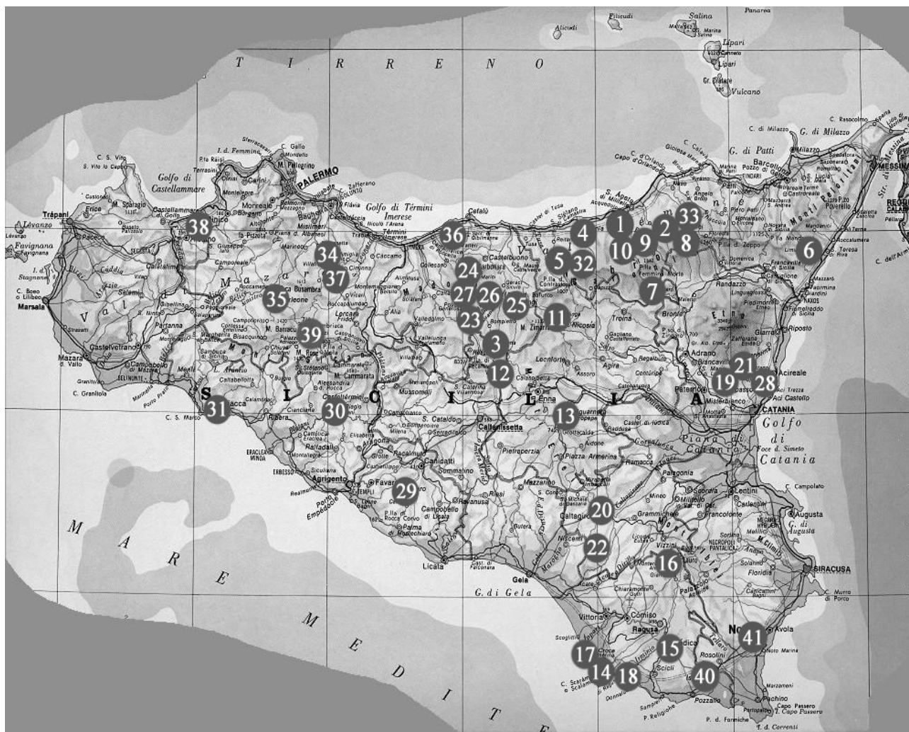
Figure 1 Map of Sicily reporting analyzed localities (scale 1:1.000.000): (1) Acquadolci, (2) Alcara Li Fusi, (3) Alimena, (4) Caronia, (5) Castel di Lucio, (6) Casalvecchio Siculo, (7) Cesarò, (8) Galati Mamertino, (9) Militello Rosmarino, (10) San Fratello, (11) Sperlinga, (12) Villarosa, (13) Valguarnera, (14) Capo Scalabri, (15) Modica, (16) Monterosso Almo, (17) Punta Braccetto, (18) Punta secca, (19) Belpasso, (20) Caltagirone, (21) Sant'Alfio, (22) Santo Pietro di Caltagirone, (23) Calcarelli, (24) Castellana Sicula, (25) Gangi, (26) Petralia Soprana, (27) Polizzi Generosa, (28) Acicatena, (29) Naro, (30) San Biagio Platani, (31) Sciacca, (32) Mistretta, (33) Tortorici, (34) Cefalà Diana, (35) Corleone, (36) Lascari, (37) Mezzojuso, (38) Partinico, (39) Prizzi, (40) Ispica, (41) Noto.

Some healers were men between seventy and eighty, except for one who was nearly a hundred! They were doctors, pharmacists, teachers, farmers, priests, shopkeepers, and one old colourful second-hand dealer (Madonìe mountains) with an unruly white beard who was an expert with herbs and 'magic' rituals. The figure of healer, still today and not just in the countryside but also in the city, emerged from our interviews as one who offered his services to cure trapped nerves, dislocations and strained muscles (' sfilatini '). Moreover, the worm-charmers or