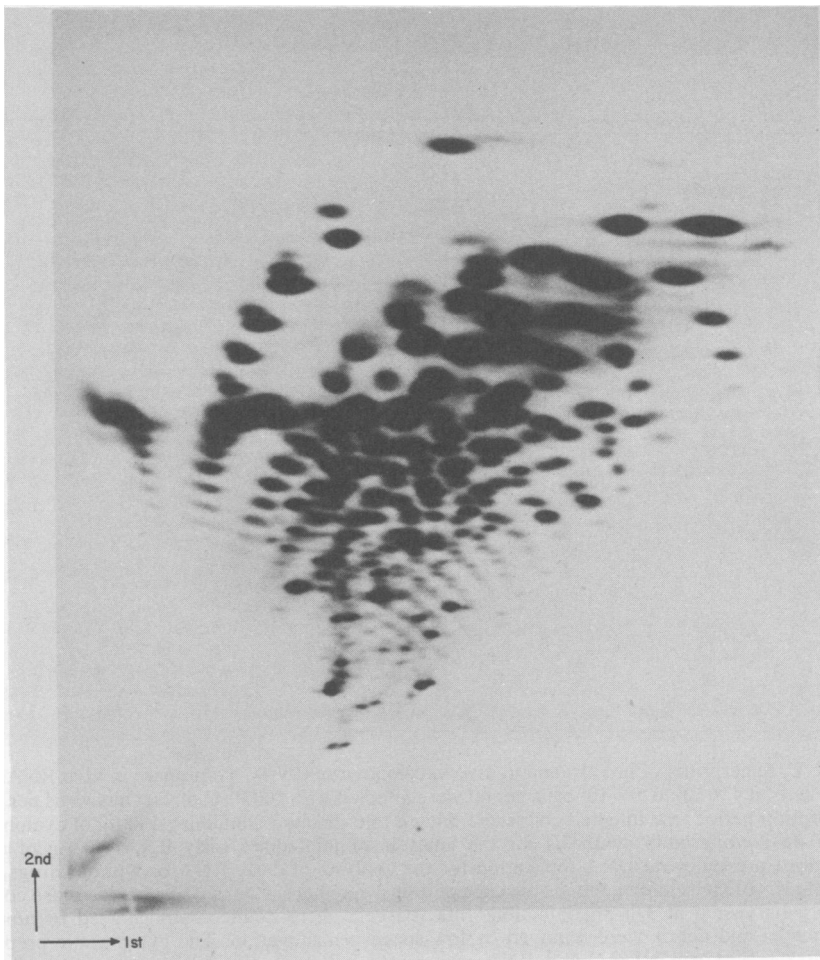
FIG. 2. RNase \text{T}_1 fingerprint of HMW RNA synthesized by vaccinia virus in vitro . HMW RNA was synthesized by vaccinia virus in vitro under conditions of limiting ATP concentrations. The RNA was extracted and sedimented on denaturing sucrose gradients (27, 30). RNA sedimenting faster than HeLa 18S ribosomal RNA was recovered from the dimethylsulfoxide-sucrose gradients, labeled specifically in the 5'-terminal cap structure, and digested with RNase \text{T}_1 as described in Fig. 1. A 3-day exposure of a gel on which 5 \times 10^5 cpm were fractionated in the dimensions indicated is shown.

It is interesting to note that the PALS and HMW RNA contain a greater complexity of 5'-terminal \text{T}_1 -resistant oligonucleotides than the in vitro 8 to 12S RNA. Since both PALS and HMW RNA are derived from reactions where the concentration of at least one triphosphate is limiting, the number of 5' ends may represent heterogeneity of initiation of the RNA transcript under these nonoptimal conditions. Heterogeneity at the 5' ends of mRNAs has been detected in vivo for other animal viruses such as adenovirus, simian virus 40, and polyoma (1, 5, 10, 11, 15, 17). Heterogeneity at the 5' ends may arise either throughout a stretch of DNA around the initiation site or more localized through the