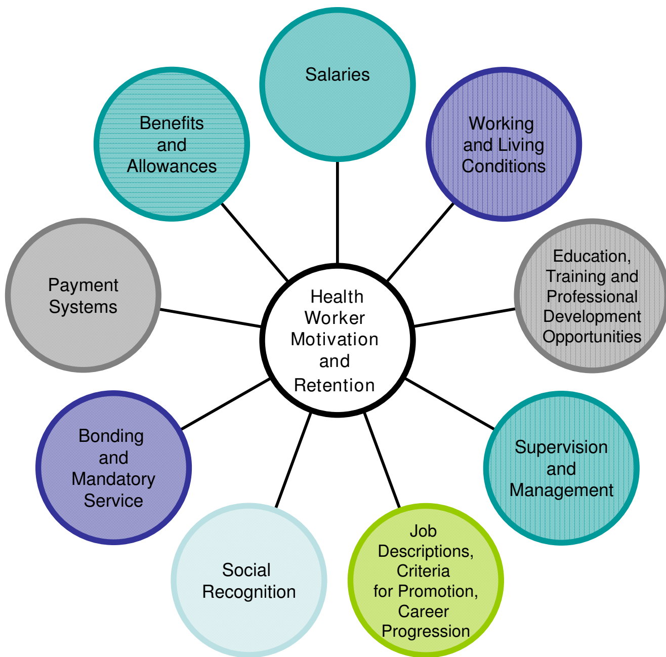
Figure 3 Factors affecting health worker motivation and retention.