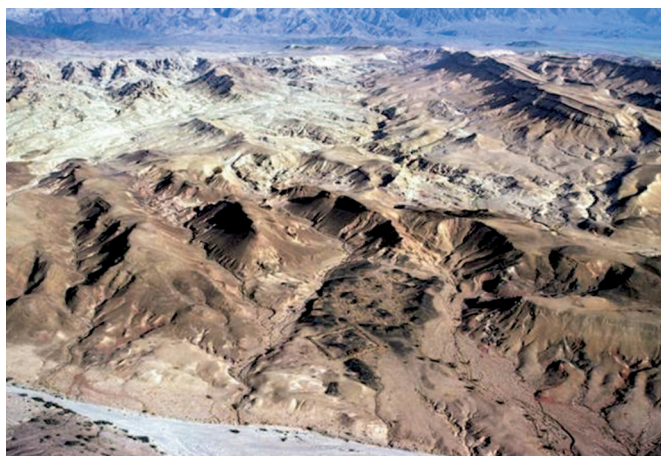
Fig. 1. Aerial photograph of KEN, Jordan, showing square Iron Age fortress (73 × 73 m), and massive black copper slag mounds on the site surface.

on the highland plateau, largely ignoring the copper ore-rich Edom lowlands. Beginning in 2002, we carried out large-scale IA surveys and excavations in the lowlands. The largest site is KEN (≈10 hectares) with >100 buildings visible on the site surface, including one of the largest IA Levantine desert fortresses (Fig. 1). KEN was first systematically mapped by Glueck in the early 1930s (13) and identified as the center of Solomon's mining activities. It was initially sampled by the German Mining Museum (GMM) in the early 1990s (14). In 2002, we excavated the fortress gatehouse (Area A), a building devoted to copper slag processing (Area S), and ≈1.2 m of the upper part of a slag mound (Area M) by using stratigraphic methods. A suite of 37 radiocarbon samples from our 2002 excavations was processed by accelerator laboratories in Oxford and Groningen and yielded early IA dates for the occupation of the site, between the end of the 12th c. and the end of the 9th c. BCE (15, 16). These dates confirmed the radiocarbon dates published earlier by the GMM (17).