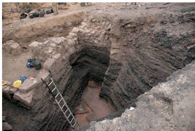
Fig. 2. Industrial copper slag mound >6 m in depth excavated at KEN (Arabic, "Ruins of Copper," Jordan). The Oxford dates published here indicate that the building and all layers above it date firmly to the mid-9th c. BC. The ≈3 m of slag deposits below the building date to the 10th c. BC. There is a built rectangular feature resting on virgin soil at the bottom of the section that may be an altar.

resolve these controversies, deeply stratified excavations to virgin soil were needed to date the full occupation span of KEN and measure the tempo and scale of metal production during the IA. Here, we report on the complete stratigraphic sequence at KEN from 2006 dated with a suite of 22 high-precision radiocarbon measurements and artifact data.