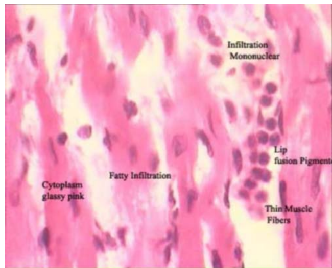
Figure 3. Longitudinal section through cardiac muscle showing Lipofuscin pigmentation, interstitial oedema, infiltration mononuclear, fibrosis and fatty infiltration in the group suffered from inequality.