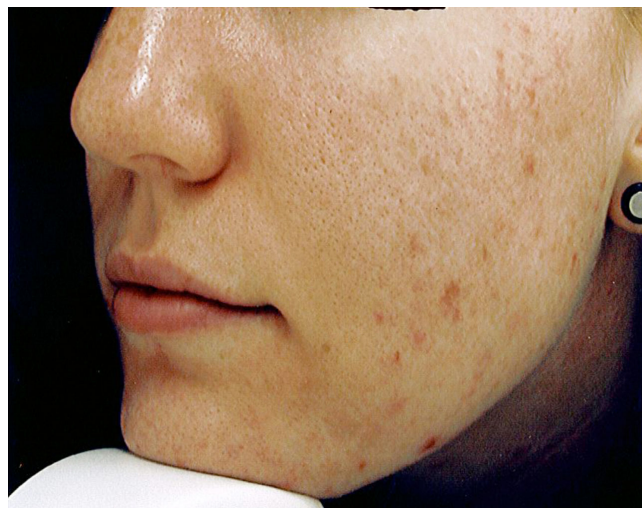
Figure 1 Subject photo before use of omega-3 poly-nutrient capsules

Based on the AIOS evaluations, the omega-3-based intervention did seem to make a difference in mental outlook