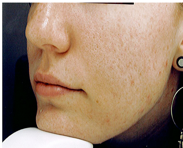
Figure 2 Subject photo after use of omega-3 poly-nutrient capsules

and global aspects of well-being over two months. We found an average 24 percent improvement in mental, emotional, and social well-being among users of the omega-3-poly-nutrient supplement. The positive changes in aspects of well-being were evenly spread among the group (range 20–27 percent) and did not appear to be associated with acne lesions, nor were they restricted to those who had the greatest reduction in acne lesions. The results are in support of a growing body of research indicating that the omega-3 fatty acid EPA can help regulate