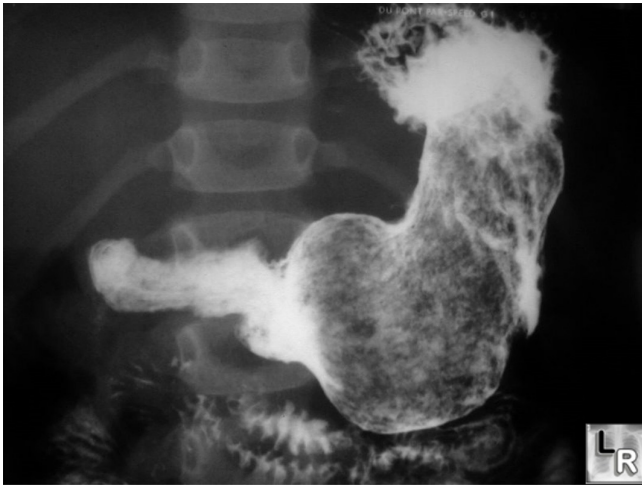
Figure 2 Barium meal showing filling defect due to trichobezoar. http://www.learningradiology.com .

specific US appearance excludes the clinical possibility of a pancreatic pseudocyst, splenic or renal mass, non-calcified gastric tumour, gastric duplication cyst and gastric outlet obstruction. However a heavily calcified mass such as teratoma, neuroblastoma or impacted mass of faeces may produce a similar US image.