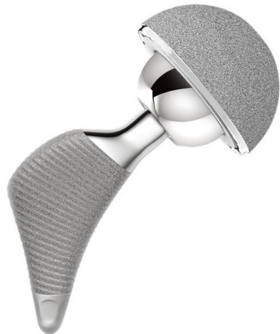
Figure 2 The DePuy Proxima™ hip.

The DePuy Proxima™ hip (DePuy International, Leeds, UK) is manufactured from titanium alloy (Ti-6AL-4V) and has a lateral flare intended to conform to the lateral femoral endosteal surface (Fig. 2). The stem has a 12/14 taper and is available in high and standard offsets. The physiological neck angle is set at 130° and the prosthesis is anatomically shaped with an anteverted neck and available in left and right versions. The entire proximal region of the stem has a sintered bead porous coating with a thin layer