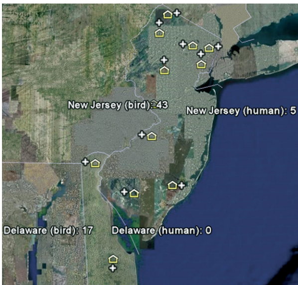
Figure 2. WNV and temperature data for Delaware and New Jersey in 2006. (Modified from Google Earth).

The application was developed in one and a half months. In addition to application development, this time included research to find available Web 2.0 resources as well as project design. The KML maps are displayed in Google Earth for 2006 and 2007 (Figures 2 and 3); they show the total number of human and bird cases and a label for each weather station. Next to each weather station is a '+' or '-', indicating whether the degree-day was above or below the assigned threshold. For 2006 and 2007, both states have every weather station above the threshold (all have a '+'), which suggests that the weather in each state supports viral transmission. However, in New Jersey, the number of human cases decreases from 2006 to 2007 while the number of bird cases remains relatively the same. In Delaware, the number of bird cases decreases slightly.