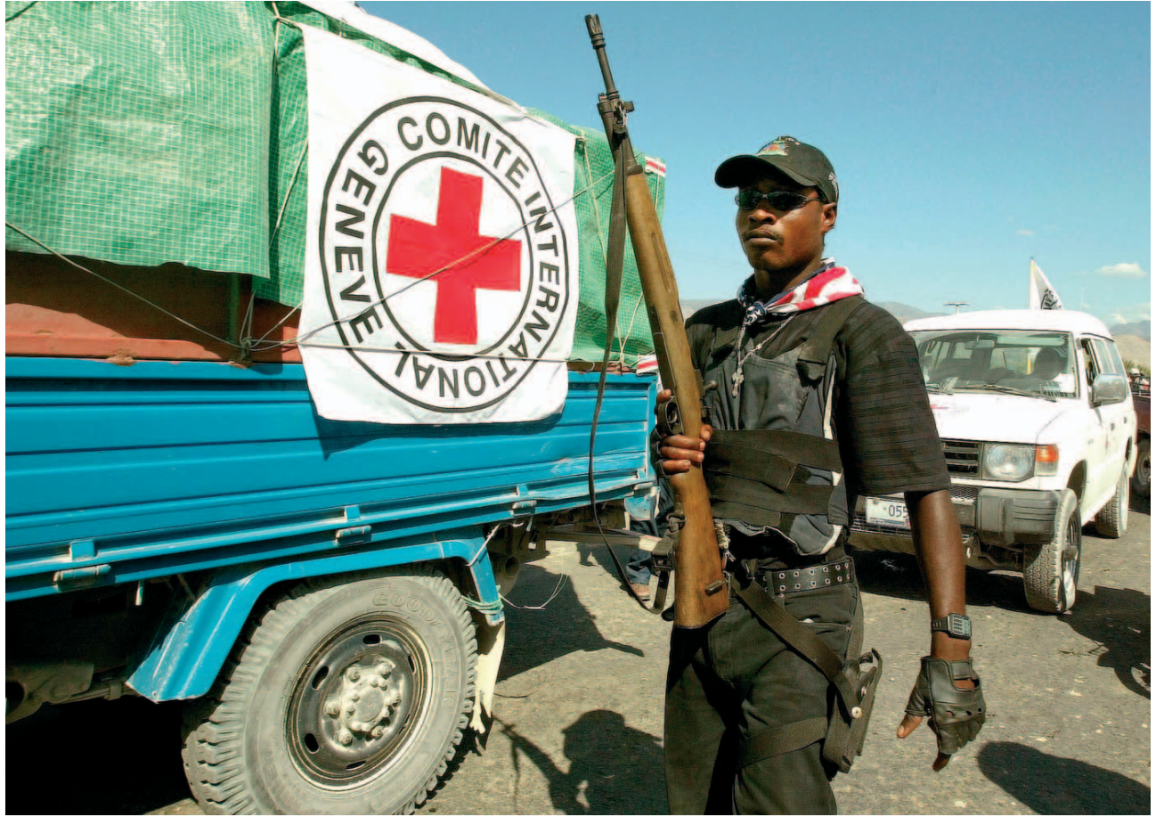
A Haitian armed rebel checks a truck from the International Committee of the Red Cross bringing medicine to the rebel-held Haitian city of Gonaives, north of the capital, Port-au-Prince.

According to WHO's Situation Report for Haiti on 8 March referring to the status of public health services in the capital, "there is no current capacity to assist patients either with injuries or with diseases."