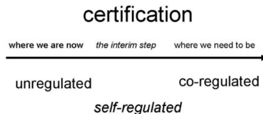
Figure 2. Certification of integrative medicine providers might follow the developmental path from no regulation to self-regulation to co-regulation.

Integrative medicine is not acupuncture and Oriental medicine, although many AOM practitioners promote their practices as integrative medicine, and practitioners of AOM are often included in integrative clinics. As with conventional physicians no one knows how many acupuncturists identify as integrative to their patients or colleagues. NCCAM, which defines AOM as an alternative whole medical system (21), has made a few educational awards to AOM colleges, most in partnership with conventional academic medical centers. The awards aim to strengthen traditional approaches to medical training within AOM colleges. This can be viewed as a clear step in the direction of trying to standardize integrative medicine training by supporting the adoption of conventional medicine training standards by at least a few AOM colleges. It is expected that graduates of these AOM colleges will be more likely to be employed in clinical settings affiliated with conventional medical