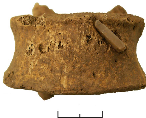
Fig. 4. A flint arrowhead embedded in a lumbar vertebra of individual 5 (grave 90). (Scale bar, 2 cm.)

often led to an a priori assumption of close genetic kinship among two or more individuals within one grave. Indeed, our image of past family life and structure is still dominated by 19 th century ideals (21) and reconstructions of prehistoric families and social units even now adhere to these orthodox schemes (22). The almost complete lack of archaeological evidence for the structure of basic social units has contributed to the persistence of these ideals, but here we have shown that basic social organization can be revealed from the study of ancient biomolecules. In Eulau, we have established the presence of the classic nuclear family in a prehistoric context in Central Europe, to our knowledge the oldest authentic molecular genetic evidence so far. Their unity in death suggests a unity in life. However, this does not establish the elemental family to be a universal model or the most ancient institution of human communities. For example, polygamous unions are prevalent in ethnographic data and models of household communities have apparently been involving a high degree of complexity from their origins (23, 24).