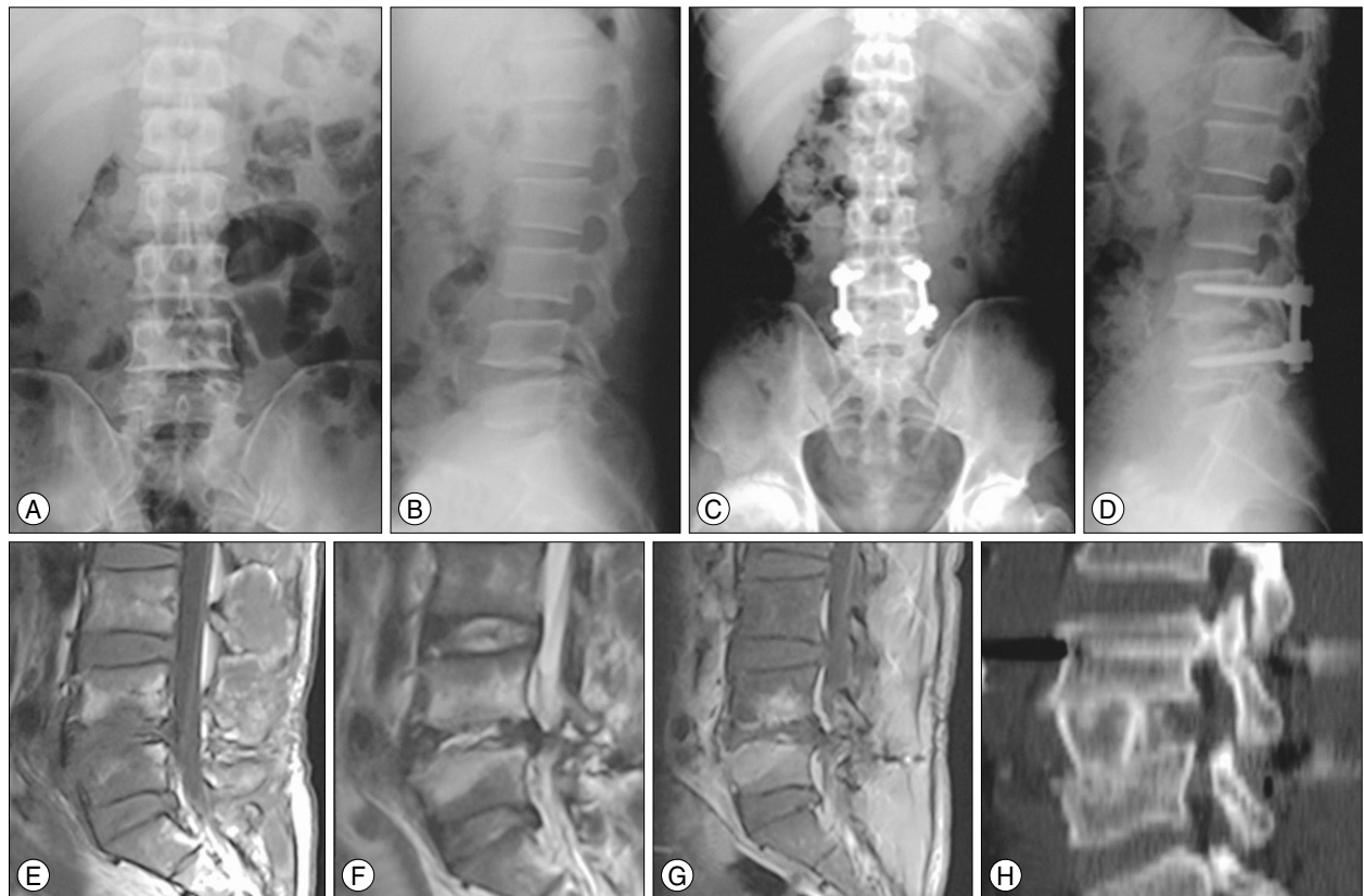
Fig. 1. A 44-year-old male with pyogenic spondylodiscitis and destruction of L4 and L5 endplate (A, B) treated with one stage anterior strut grafting at L4-L5 and posterior transpedicular stabilization of L4-L5. Spinal canal encroachment by infectious debris and L4, L5 endplate destruction with ring enhancement at the disc space can be seen (E-G). Postoperative X-rays (C, D, H) demonstrate a good fusion state and lumbar lordotic curvature.

A 44-year-old male was transferred to our hospital with progressive, severe back pain with both leg radiating pain and weakness. Magnetic resonance imaging studies and X-ray films revealed findings consistent with spondylodiscitis at L4-L5. Patient was treated as one-stage anterior strut grafting and posterior transpedicular stabilization from L4 to L5. Intraoperative culture was obtained, and the