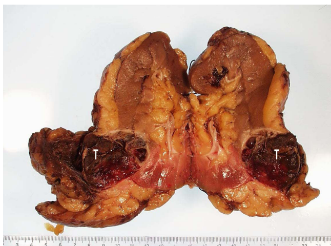
Figure 2 Same tumour after nephrectomy (T).

no statistically significant difference between the two measurements. However in 5 (5%) patients who were not offered nephron sparing surgery based on CT findings (size > 40 mm) the pathological size was ≤ 40 mm (p = < 0.001, Fishers Exact test). When further subdivided into various size ranges the difference between CT and pathology are shown in Table 1 and 2. In general CT tended to overestimate tumours less than 70 mm and underestimate tumours greater than 70 mm.