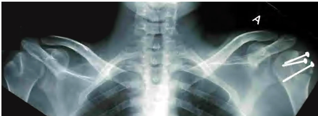
Figure 3 Post surgery radiographic control.

consciousness after the seizure did not allow the patient to react and reflexly protect one of his arms by exposing the other.