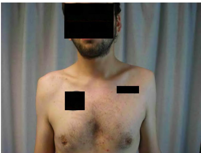
Figure 1 The clinical view of a 3 weeks neglected bilateral anterior shoulder dislocation after a seizure.

Bilateral reductions under general anaesthesia and internal fixation of the left greater tuberosity fracture were performed (Fig. 3). The reductions were easy to perform and shoulders' stabilisation was not carried out. No post manipulation neurovascular deficit was observed. Ultrasonography performed 4 days post surgery confirmed the integrity of rotator cuffs in both shoulders. Broad arm polyslings in abduction and internal rotation were used for 2 weeks and progressive mobilization started with pendulum exercises, forward flexion and abduction. A physiotherapy program of muscle enforcement was added at 3 weeks. The recovery was successful and after 2 months the patient had regained a normal range of motion in both shoulders with a minor lack at the last degrees of flexion and internal rotation of the left shoulder. Four months post-operatively the range of motion was fully recovered bilaterally and at the final follow-up, 2 years post surgery, the patient had not undergone any recurrent dislocation.