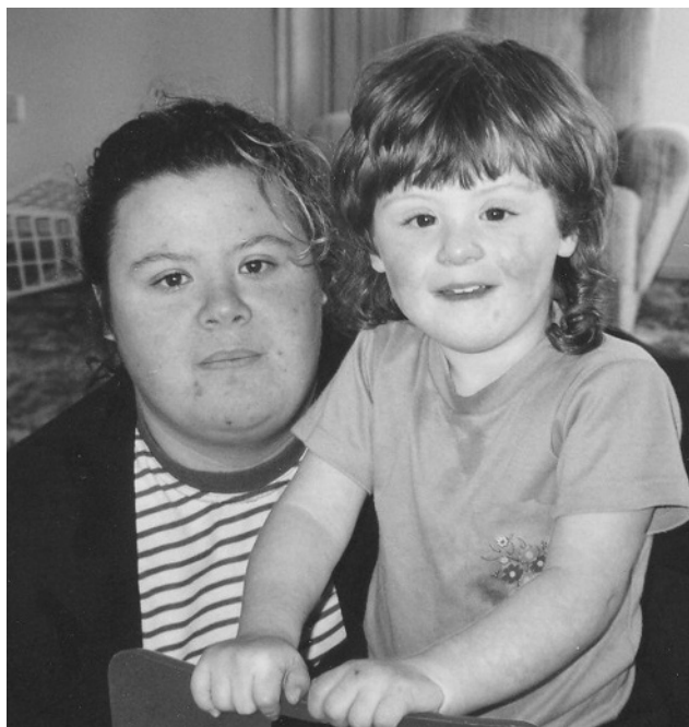
Figure 1 Mother and daughter were found to have microduplication of the Down syndrome critical region (DSCR). Informed consent was obtained for publication of this figure.

hydrops, and died soon after birth 3 days later. External examination of the baby, despite its hydropic appearance, suggested DS, with round face, brachycephaly, upslanting palpebrae and protruding tongue (fig 2). Autopsy showed small size of all internal organs for gestational age, indicating generalised growth failure, but no cardiac or other malformation was found. Re-examination of the karyotype from Chorionic Villus Sampling including FISH of the DSCR on 21q22 was requested, but no abnormality could be confirmed at the resolution obtained. However, owing to ongoing clinical suspicion of DS in the family, FISH was rescanned on interphase cells. This showed a microduplication with two copies of the DSCR contig probe for D21S259, D21S341 and D21S342 (Vysis™) on one chromosome 21, corresponding to bands 21q22.13–21q22.2 (fig 3A).