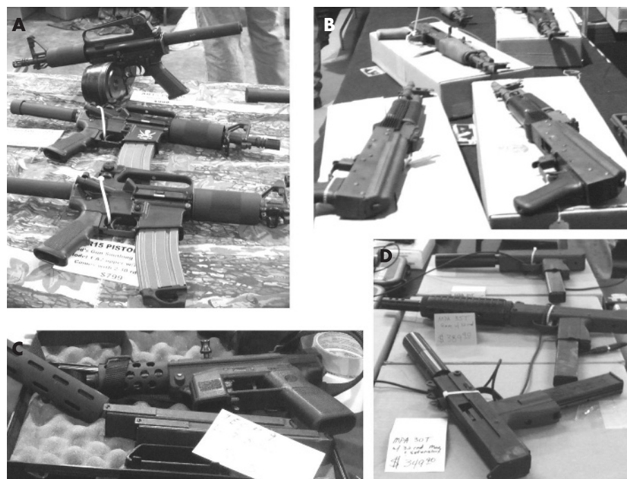
Figure 3 Examples of assault-type handguns. (A) AR15-type pistols. The gun in the rear is equipped with a 100-round magazine. (B) AK47-type pistols. (C) A TEC9 pistol. (D) MAC-type pistols.

in other states (23.4% and 4.1%, respectively, p < 0.0001 ) but not in California (11.1% and 7.1%, respectively, p = 0.61 ).