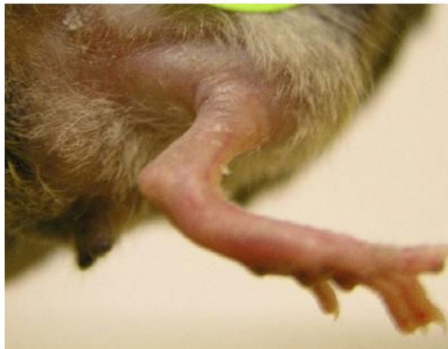
Figure 3 Photograph of representative irradiated leg of TSK mice showing minor damage 110 days post-irradiation compared to parental control. The TSK mice had relatively normal legs (panel B) post-irradiation except for hair loss whereas parental control mice (panel A) showed extensive skin and leg injuries following the radiation exposure.