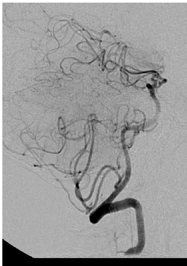
Figure 1 Cerebral angiogram demonstrating calcified abnormality in the distal basilar artery. Flow is seen in the distal basilar artery after 10 mg of tissue plasminogen activator was infused in a pulsatile fashion over 30 minutes.

after discharge; however, the patient was lost to follow-up and did not return to the vascular clinic.