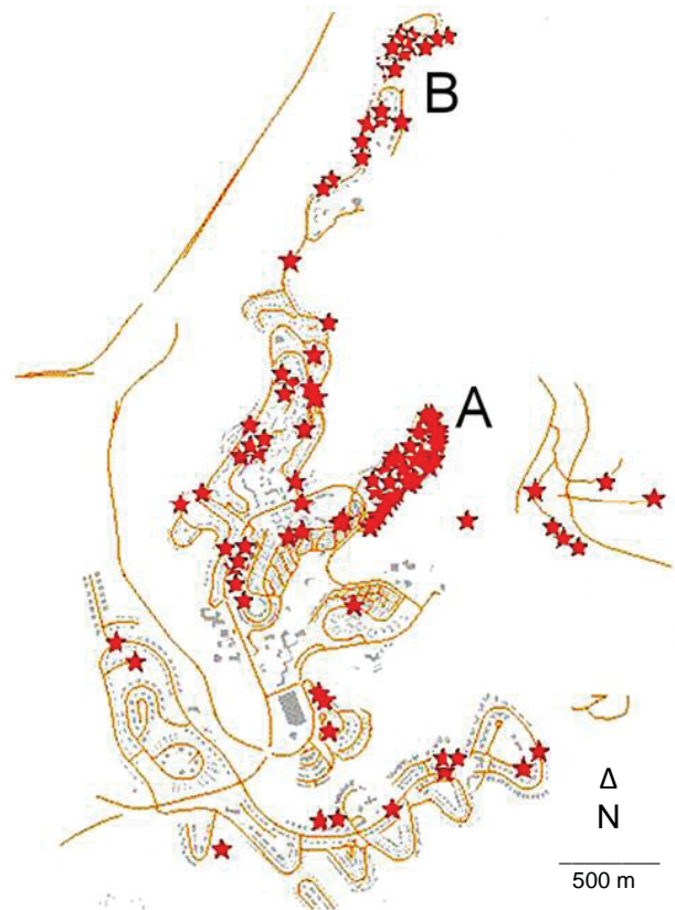
Figure 2. Geographic distribution of cutaneous leishmaniasis cases in Ma'ale Adumim, Israel, 2004–2005. Each star represents 1 case. In dense areas, some marks may be missing because of technical limitations. Wilderness ravines (white areas) reach within meters of houses at the periphery of the neighborhood in all directions. A and B indicate neighborhoods with the highest incidence rates.

In 2006, Chaves and Pascual reported that climate was a valuable covariate in predicting incidence of CL (12). A 1996 computerized model examined the effect of warming of 1°C, 3°C, and 5°C on the likelihood of CL transmission at 115 southwest Asian sites. Sandflies are not known to reproduce in Jerusalem, but Cross and Hyams suggest that Jerusalem could support endemic transmission if the average temperature increased by 1°C (13). Since that model was proposed, the average temperature in Jerusalem has increased by ≈1°C (14). The spate of recent outbreaks sug-