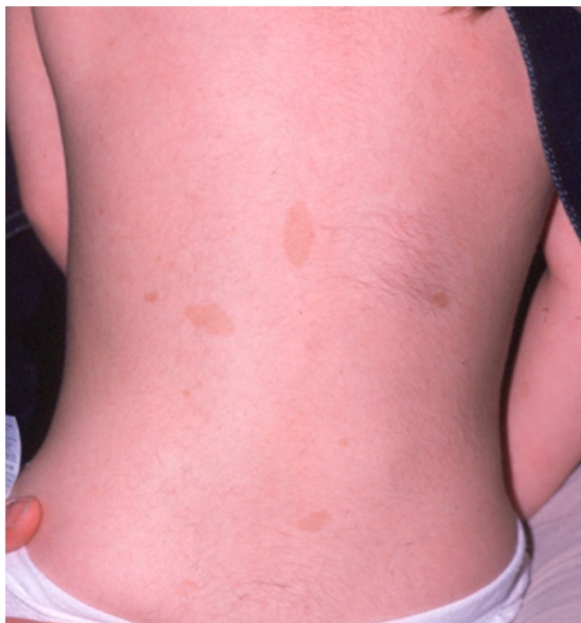
Fig 1. Café-au-lait spots

population under 16 years of age. Figure 2 shows the incidence of NF1 in Northern Ireland from 1997-2002 and shows the number of cases that were the result of new mutations. Of the 75 cases, 38 were male and 37 female. The mean age was 9.3 years (range 0.9 - 16.8 years).