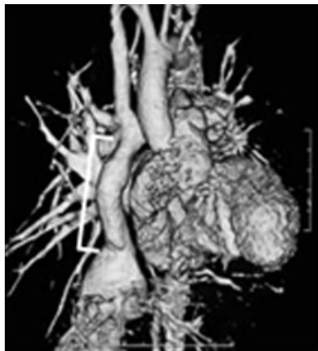
B. 3-D CT angiogram of tissue-engineered EC TCPC one year after implantation.

United States alone. Currently used vascular grafts require endovascular interventions or replacement within two years of implantation. Similarly, clinical results associated with use of synthetic small caliber vascular grafts for the treatment of both cardiovascular and peripheral arterial disease are so poor as to prohibit their use in most circumstances. It is estimated that creation of an improved small caliber arterial graft would affect the lives of more than 100,000 patients per year in the United States. These patients require life- or limb-saving operations that