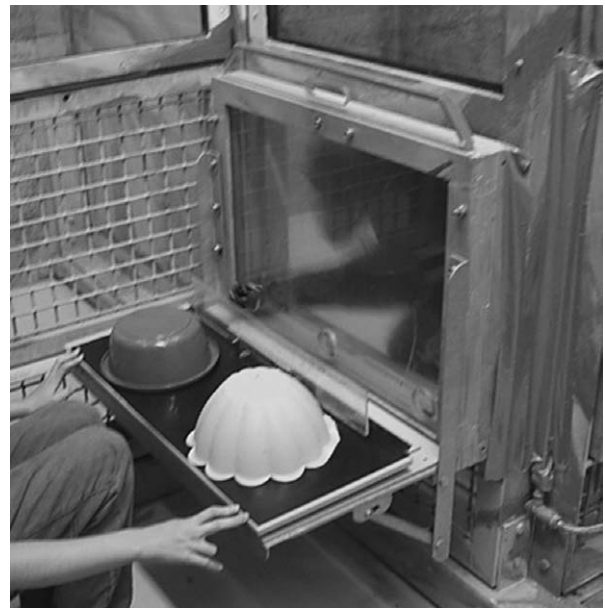
Figure 1. Apparatus. Chimpanzees and bonobos chose between fixed and risky rewards hidden under bowls.

In choices between a fixed and a risky reward option (using choice trials from all sessions), chimpanzees were risk seeking (mean \pm s.e. proportion choosing fixed option, 0.36 \pm 0.04 ), significantly preferring the risky reward ( t(4) = -3.48 , p = 0.025 one sample t -test, all reported comparisons are two-tailed). In contrast, bonobos were risk averse ( 0.72 \pm 0.03 ), preferring the fixed reward to the risky ( t(4) = 6.40 , p = 0.003 ).