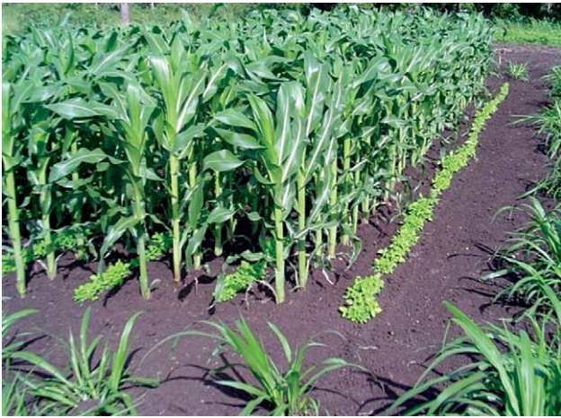
Figure 3. Maize : D. uncinatum at 1:1 in full push-pull in Suba district.

Napier grass can be embarked upon. The push-pull system can be taken up beyond this particular project, provided that farmers can acquire the necessary knowledge and techniques for establishing the companion crops and, for example, the Sasakawa Africa Foundation in Ethiopia under Marco Quinones (2006, personal communication) has successfully established Desmodium species as intercrops.