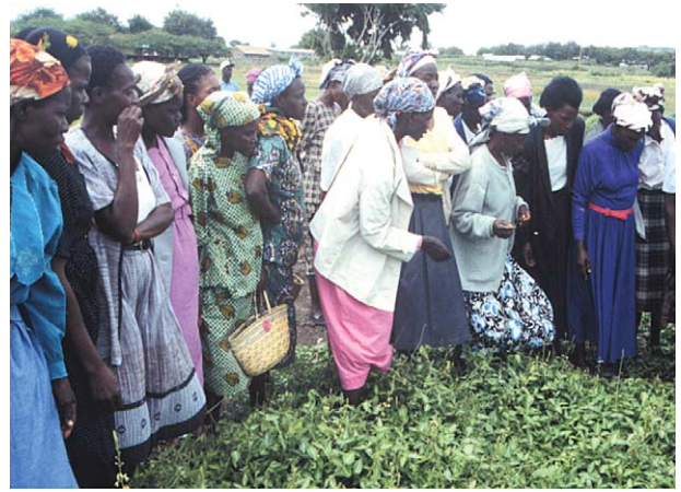
Figure 4. Women's group responsible for producing D. uncinatum seed.

It may be considered that producing a maize variety capable of releasing ( E )-ocimene and ( E )-4,8-dimethyl-1,3,7-nonatriene from the intact plants, as is the case with molasses grass, would be a way forward. Maize is already capable of producing both compounds, but only does so, at sufficient levels for crop protection, at high levels of infestation. None the less, if release could be enhanced and linked to earlier and more minor stages of infestation, perhaps even just oviposition, then the maize would protect itself more effectively. Such efficient protection may allow selection among the stem borers to rely more heavily on other cues, and the parasitic wasps could be selected for cues more closely associated with their hosts. However, the integrated push-pull system involves other means of pest population reduction, i.e. the trap crop, which