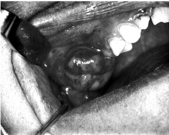
Figure 1. The soft tissue mass is seen on the right side of maxillary alveolar crest on intraoral examination.

Intra oral examination revealed a 2 cm sized, fibrotic, non bleeding mass coinciding with a dense expansion in bone (Figure 1). The lesion on the alveolar ridge was in lobular form. Although muco-