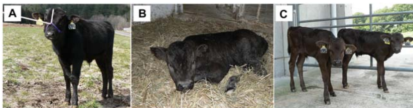
Figure 3. Calves cloned from Yasufuku's frozen testicles. (A) A male calf derived from Yasufuku's testicles was born on 30 November 2007. Parturition was induced by injection of prostaglandin F 2 α after 287 days of gestation and the recipient animal delivered this calf two days after induction. The calf's birth weight was 18.5 kg and he remains healthy at the time of writing. (B) A male calf, derived from a vitrified SCNT embryo, that was delivered by Caesarean section on 5 March 2008, after 286 days of gestation. The calf's birth weight was 47.5 kg; he died two days after birth. (C) Male calves derived from vitrified SCNT embryos. The calf with an ear tag "c95" was born on 22 July 2008, at 287 days of gestation. Its birth weight was 32 kg. The calf with an ear tag "c66" was born on 31 July 2008, at 288 days of gestation. Its birth weight was 30 kg. Parturitions were induced as described above. Both remain healthy at the time of writing. doi:10.1371/journal.pone.0004142.g003

Gametes, zygotes, embryos and/or cell cultures derived from elite livestock or endangered animals have often been cryopreserved in 'Gene Banks' [7,8]. Our results suggest that intact and