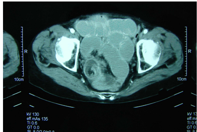
Figure 1 Abdominal computed tomography scan showing the characteristic "target sign", establishing the diagnosis of intussusception.

The pathology report confirmed that the neoplasm was a small bowel GIST. The margins of surgical resection and all identified mesenteric lymph nodes were negative for