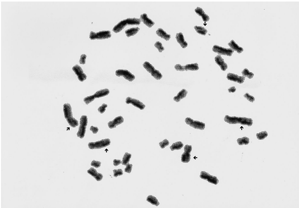
Fig. 1. In the normal state, one of the sister chromatids is stained dark, while the other is stained light. When a reciprocal change occurs, a dark segment and its homologue light counterpart change places leading to alternating dark and light regions throughout the chromatids.

The SCE frequency per metaphase was calculated in all patients and compare within each