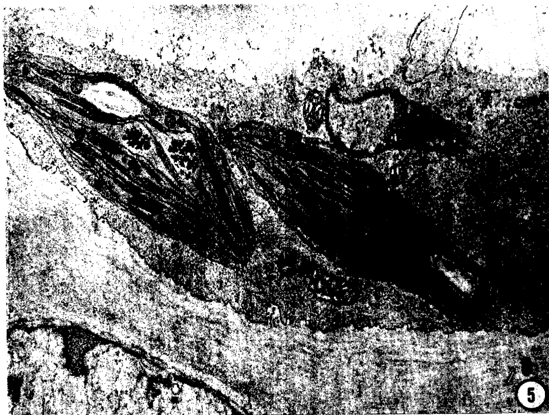
Fig. 5. After 4-wk exposure to the 16-h light-8-h dark cycles, the plastids in tomato roots inoculated with Meloidogyne incognita are fully differentiated. Their size and ultrastructure cannot be readily distinguished from those of the leaf chloroplasts. \times 16,000 .

4. Endo, B. Y. 1971. Nematode-induced syncytia (giant cells). Host-parasite relationships of Heteroderidae. Pp. 91-117 in B. M. Zuckerman, W. F. Mai, and R. A. Rohde, eds. Plant parasitic nematodes, vol. 2. New York: Academic Press.