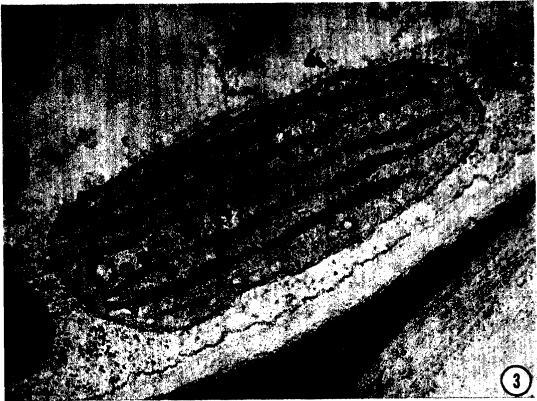
Fig. 3. After 2-wk exposure to 16-h light-8-h dark cycles, tomato roots inoculated with Meloidogyne incognita have cells that contain plastids whose ultrastructure resembles that of developing leaf chloroplasts. The internal membrane system consists of parallel arrays of single and stacked thylakoids. \times 70,000 .

in light : Uninoculated roots grown on a STW medium containing kinetin turned green when exposed to light but did not accumulate pigment when grown in the dark. Galls did not develop on these cultures; consequently, normal root segments exhibiting the green pigmentation were prepared for observation after a 4-wk incubation. Examination of the cortical parenchyma cells from these roots revealed enlarged plastids which contained a few starch grains and a well-developed internal membrane system consisting of single and stacked thylakoids (Fig. 6). The general appearance of these plastids was consistent with that found in the 4-wk-old inoculated, light grown roots (Fig. 5) and also with the typical chloroplast found in mature leaf tissue (Fig. 7).