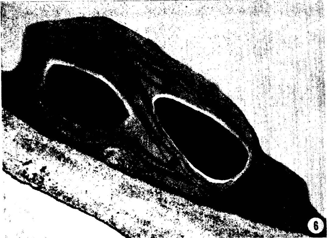
Fig. 6. Plastids from uninoculated root tissue of tomato which was grown in a 16-h light-8 h-dark cycle for 4 wk on a medium containing kinetin. Under these conditions, the plastids develop an internal membrane system very similar to that shown in Fig. 4; i.e., grana consisting of 2-5 thylakoids are interconnected by the single stroma membranes. \times 32,000 .