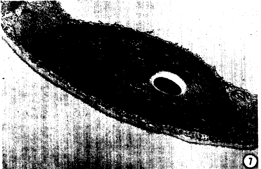
Fig. 7. Mature chloroplast from the leaf mesophyll of tomato. \times 28,000 .