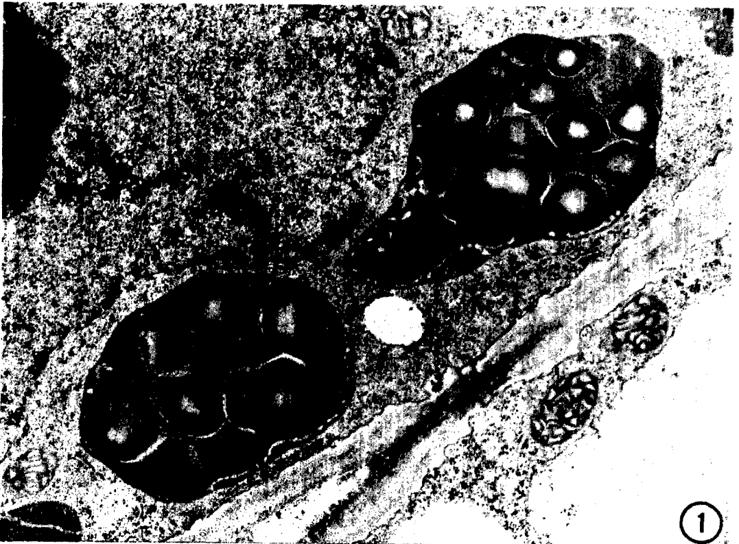
Fig. 1. Plastids (amyloplasts) in a cortical parenchyma cell of tomato root after inoculation with Meloidogyne incognita and incubation in 16 h light and 8 h dark. The amyloplasts contain numerous small starch granules but do not exhibit any atypical membrane structures. × 28,000.

After 1 wk the amyloplasts became more oblate and generally measured more than