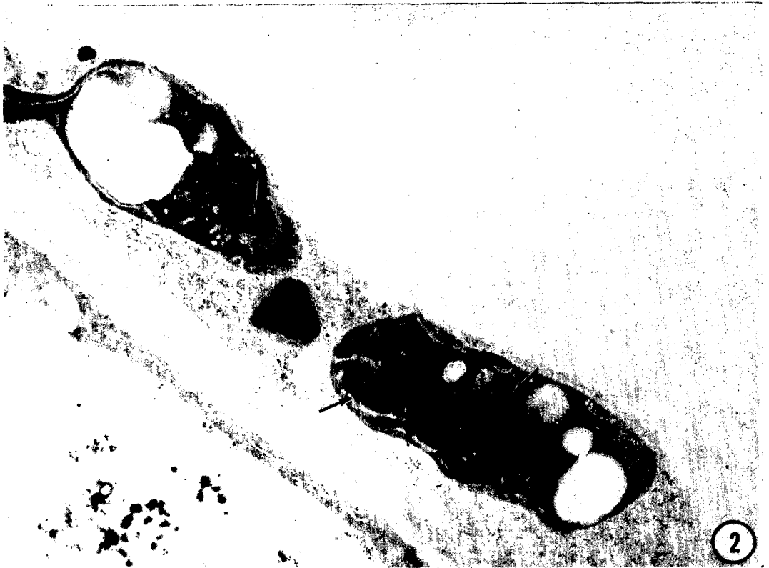
Fig. 2. Plastids from a tomato root parenchyma cell following inoculation with Meloidogyne incognita and incubation in 16-h light-8-h dark cycles for 1 wk. Stacked membranes (arrows) have begun to form grana in the stroma of the plastid. (Because the grana are randomly oriented at this stage, cross-sections do not reveal sharply delineated membranes). \times 24,000 .

3.0 \mu\text{m} in length (Fig. 2). Although starch granules were still present, they were less abundant than at 24 h. The most significant change at this time was the presence of vesiculated membranes around the periphery of the stroma and the appearance of groups of 2-4 stacked thylakoids which occurred randomly dispersed in the stroma of the plastid. In addition, crystal-containing microbodies, resembling the peroxisomes found in photosynthetic mesophyll tissue of leaves, were observed in the cytoplasm near the plastids.