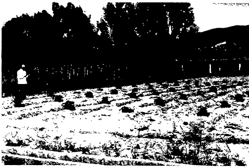
FIG. 1. Microplots at Tecamachalco, Mexico, on day of harvest showing the experimental design and type of container used.

er (pH 7.2) and applied at the desired concentration to the soil around the plant roots. The soil was irrigated to incorporate the lectins as specified in the description of each experiment. At Amherst the same amount of 10 mM Tris buffer (pH 7.2) was applied to the untreated controls and to the lectin treatments. Aldicarb treatments were concurrent with those of the lectins. Hatched second-stage juveniles in tap water were added to the soil 24 hours after application of lectins or aldicarb.