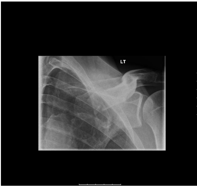
Figure 1 Oblique radiograph of the left clavicle demonstrating a fracture of the medial third (day 0).