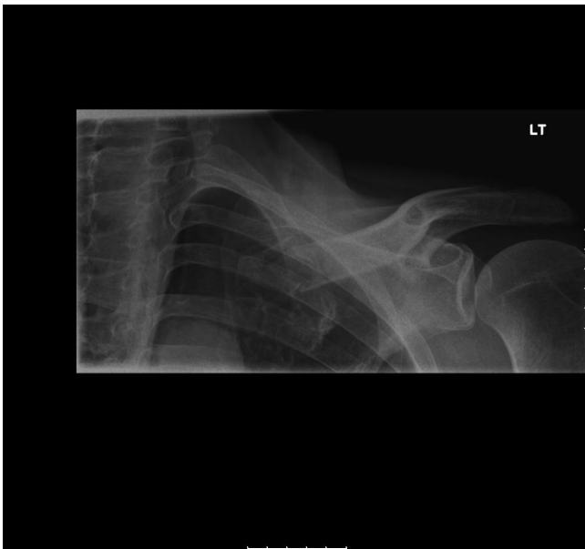
Figure 2 AP radiograph of the left clavicle demonstrating a fracture of the medial third with an opacity extending from the fracture site in the soft tissues of the neck (day 8).

history of peptic ulcer disease and current excessive alcohol usage. Plans were made for him to be followed up in the out-patient clinic to monitor his condition, but he failed to attend any further follow-up appointments.