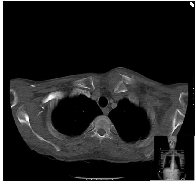
Figure 3 Axial CT image showing a displaced fracture of the left clavicle (day 8).

Traumatic myositis ossificans circumscripta was diagnosed. The patient was informed that his condition would be managed non-operatively. Non-steroidal anti-inflammatory medications were not prescribed due to his past