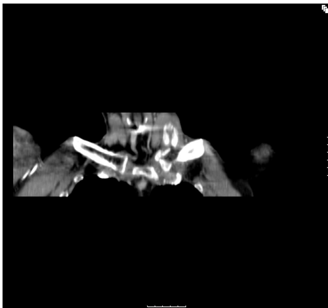
Figure 5 Reformatted coronal CT image showing a fracture of the clavicle with an osseous lesion within the sternocleidomastoid muscle (day 8).