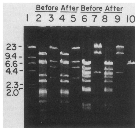
FIG. 1. Agarose gel electrophoretic analysis of restriction digests of pYA1061 and pYA1062 plasmid DNA isolated from before in vivo packaging in \chi 2819 and after transduction of in vivo-packaged cosmids into \chi 2866. Lane 1, \lambda DNA digested with Hind III (sizes are given in kilobases to the left of the gel); lanes 2 and 3, pYA1061 isolated before in vivo packaging and digested with Pst I and Hind III, respectively; lanes 4 and 5, pYA1061 isolated from \chi 2866, after transduction and selection for Tc r , digested with Pst I and Hind III, respectively; lanes 6 and 7, pYA1062 isolated before in vivo packaging and after digestion with Pst I and Hind III, respectively; lanes 8 and 9, pYA1062 isolated from \chi 2866, after transduction and selection for Tc r , digested with Pst I and Hind III, respectively; lane 10, pHC79 digested with Pst I.

Complementation analyses. A contiguous genomic library of S. typhimurium DNA was constructed in pMMB34. A total of 928 kanamycin-resistant (Km r ) clones were screened