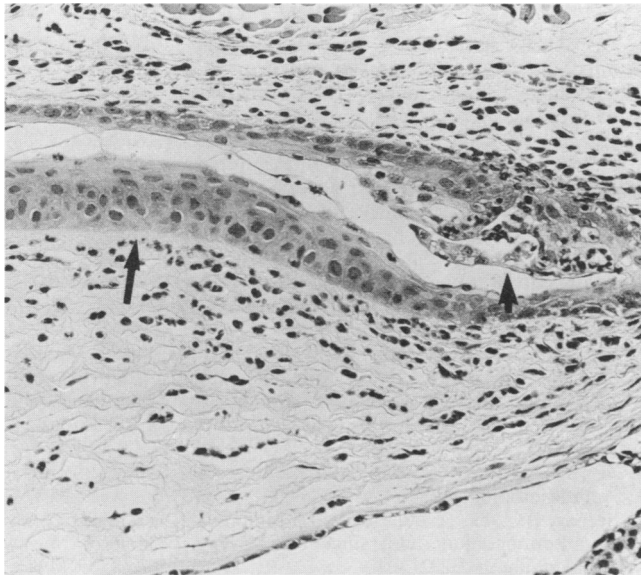
FIG. 1. Histology of palpebral conjunctiva, fornix, and cornea. Infiltration of polymorphonuclear leukocytes into the epithelial layer of fornix (◆) and submucosal areas of conjunctiva and cornea (◀). Magnification, ×66.

and small loci of hemorrhages were observed at 24 h after infection with Sereny-positive strains. Gram stain revealed the presence of accumulated gram-negative bacilli in the submucosal connective tissue. Degeneration with or without invasion of polymorphonuclear leukocytes and desquamation of epithelial layers of palpebral conjunctiva and fornix were found (Fig. 1). These pathological changes were more prominent in the fornix. In the cornea, degeneration of epithelial cells and infiltration of inflammatory cells in the substantia propria, especially at 48 h after infection, were observed without clear change of corneal endothelia. Inflam-