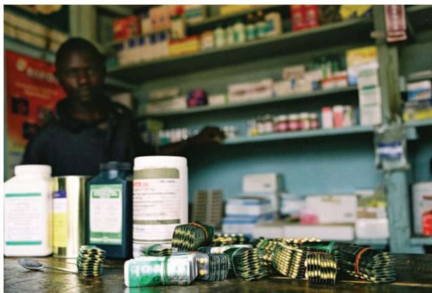
An unlicensed pharmacy in the Democratic Republic of the Congo, where the quality and validity of the drugs on sale can not be guaranteed.