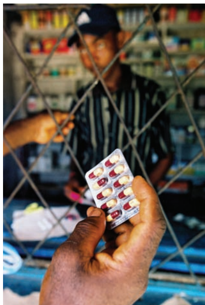
Unlicensed medicines on sale in the Democratic Republic of the Congo