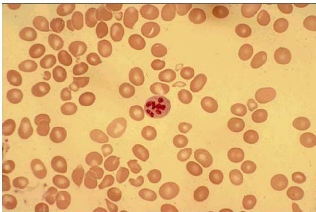
Figure 2 Peripheral smear of case 2 demonstrated macrocytosis with anisopoikilocytosis and one hypersegmented neutrophil/granulocyte with schistocytes.

Hb 11.8 g/dL with MCV 99 fL, platelet 250,000/mm 3 ; serum vitamin B12 level 611 pg/mL, folate level 11.2 ng/mL, and homocysteine level at 11.2 μmol/L. Bilirubin, LDH and haptoglobin were all within the normal range.