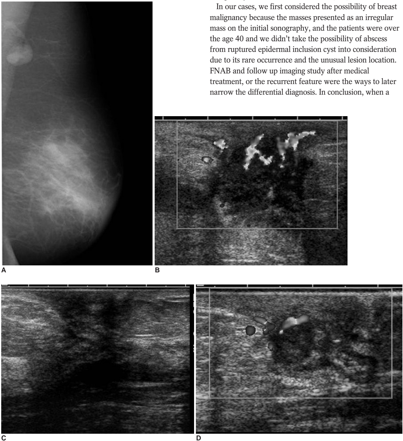
Fig. 2 A 44-year-old woman with periareolar pain of the left breast.

In our cases, we first considered the possibility of breast malignancy because the masses presented as an irregular mass on the initial sonography, and the patients were over the age 40 and we didn't take the possibility of abscess from ruptured epidermal inclusion cyst into consideration due to its rare occurrence and the unusual lesion location. FNAB and follow up imaging study after medical treatment, or the recurrent feature were the ways to later narrow the differential diagnosis. In conclusion, when a