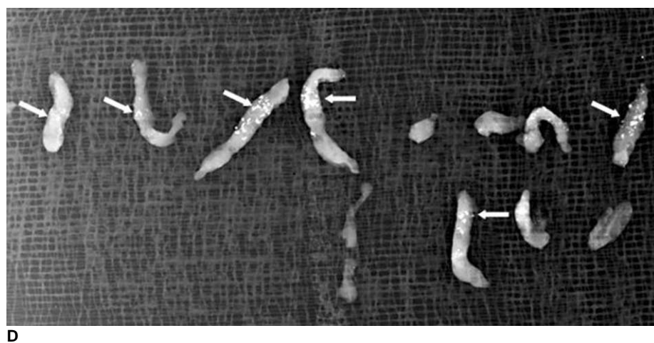
Fig. 1. 44-year-old female who underwent mammography for routine breast screening. A. Magnification view of left breast reveals suspicious clustered and pleomorphic microcalcification (white arrow). B. Careful US study of left breast shows microcalcification of suspicion (white arrows) in left upper central aspect. C. Patient underwent 11 gauge US-guided vacuum-assisted biopsy targeted at microcalcification. D. Specimen mammography shows that aimed microcalcification is retrieved (white arrows). Patient was diagnosed with ductal carcinoma in situ and underwent further partial mastectomy, which also revealed presence of ductal carcinoma in situ.