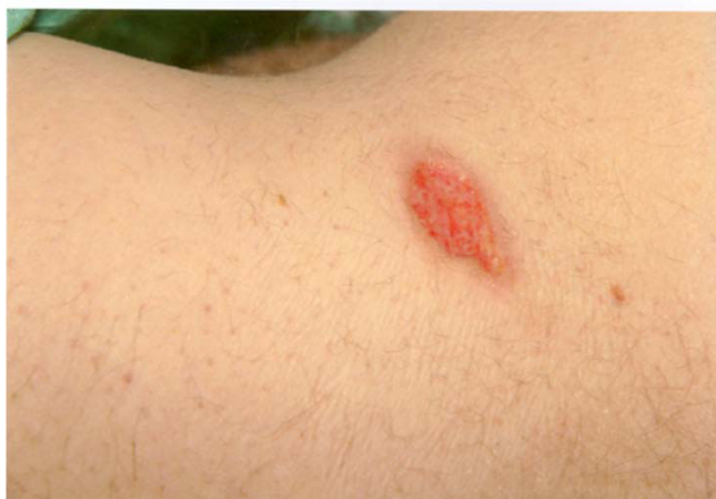
Figure 1 Ulcerated lesion over his left loin.

at 3 days were positive. Chest radiograph on admission was abnormal; showing a 3.8 cm area of nodular shadowing in the right upper zone (Fig 2) which prompted computed tomography (CT) imaging of the chest (Fig 3).