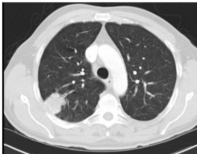
Figure 3 Computed tomography (CT) imaging of the chest.

conjunction with immunocompromise secondary to HIV confirmed the diagnosis of disseminated cryptococcosis.