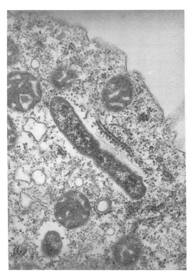
FIG. 3. Bacterial rod demonstrating binary fission within an Acanthamoeba organism, surrounded by several mitochondria. Magnification, \times 21,000 .

We conclude that these bacteria are endosymbionts which are obligate in their need for an amoebic host in which to multiply. Furthermore, these endosymbionts may be host (species or strain) specific, since they are not universally present in Acanthamoeba spp. The actual mechanisms of transmission are not well understood. Some endosymbionts are thought to persist and spread by cellular heredity alone,