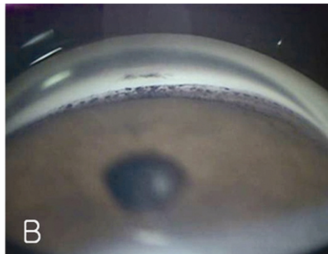
Fig. 2. Width of iridocorneal angle at 9 months after ICL surgery. (A) Peripheral iris was very steep and convex. Iridocorneal angle was narrowed because of the obstruction of LI sites. (B) After additional LI, although the angle width increased, trabecular pigment also increased. 25 \times , Goldmann 3 mirrors.