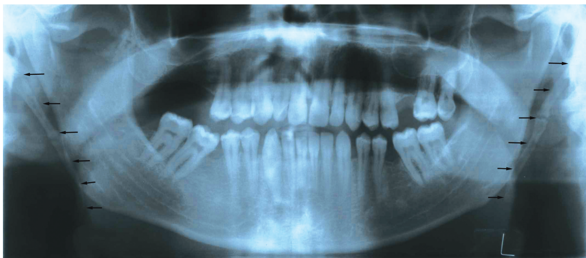
Figure 1. Panoramic radiograph showing in a patient with bilateral elongated styloid processes (arrows).

The observed results were analyzed with SPSS 15.0 (Statistical package for social science Inc., Chicago, Illinois, USA). t -test and Chi-Square