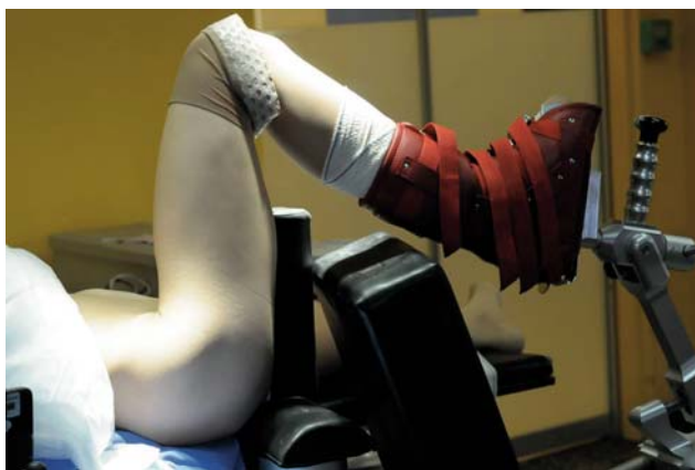
Fig. 5 At the end of the procedure, the impingement is tested with flexion, internal rotation, and adduction.

THA. Distribution of all variables (NAHS score, age, lesion depth) was tested for normality using the Ryan-Joiner and Shapiro-Wilk tests. For normally distributed variables, when two groups (preoperative patients group and postoperative patients group) had the same variances, differences between them were analyzed using Student's t-test. For abnormally distributed variables or normally distributed variables with different variances, we used the