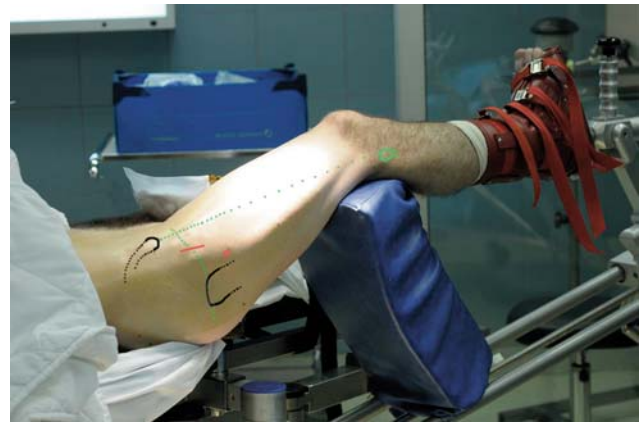
Fig. 1 The patient is positioned supine with the traction device. The traction is only applied on the operated lower limb during the acetabular time. The approach is made with slight flexion. No fluoroscopy is needed. The incision is anterolateral and approximately 2 to 4 cm. The skin incision is parallel to the classic incision described by Hueter but moved downward approximately 1.5 cm to prevent injury of the lateral nerve of the thigh. The incision is centered on the summit of the great trochanter. Another more lateral and lower portal is used for the scope.

All 100 hips underwent surgery with the same procedure by the senior author (FL). The patients were in supine position on a regular table with an extension to allow traction along the axis of the operated lower limb (Fig. 1). In order to minimize the risk of traction complication, the other leg was kept free so as to allow pelvic tilt if too much traction was applied. The size of the perineal post was 12 cm. We did not use fluoroscopy. The knee was slightly