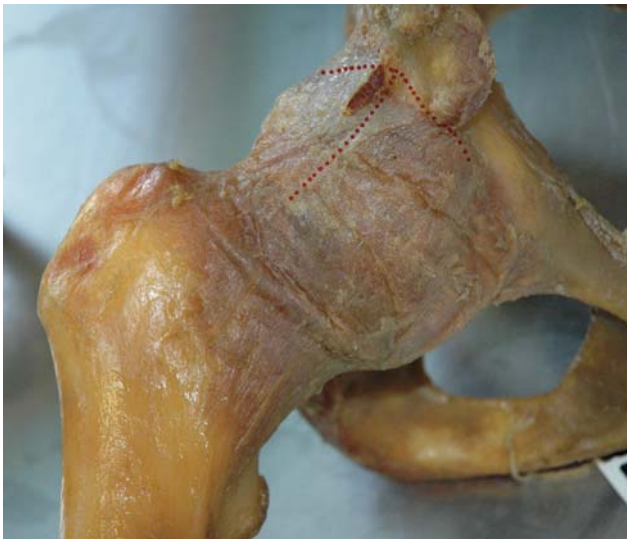
Fig. 3 T-shaped opening of the capsule. It may be sometimes necessary to cut the reflected head of the rectus femoris to improve access to the acetabulum.

acetabular cartilage and the examination of the deep part of the labrum with the arthroscope. The duration of traction ranged between 5 and 45 minutes and was used only during the acetabular surgical procedure. The mean traction duration was about 32 minutes if the labrum was refixed and about 11 minutes otherwise.