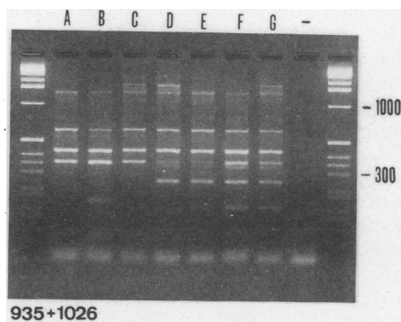
FIG. 1. PCR-mediated DNA typing of MRSA strains. Lanes A to G show the various banding patterns among a collection of 48 MRSA strains. Primers 935 and 1026 were used (see Table 1). -, negative control. The lengths of two of the molecular size markers (1-kb ladder; GIBCO-BRL) are indicated on the right, in base pairs.

nation. Subjection of DNA from the 48 different MRSA strains to PCR with primers 935 and 1026 revealed seven different banding patterns (Fig. 1). PCR analysis with primer 1014 revealed six different banding patterns within this group (Fig. 2). When the 48 MRSA strains were subjected to PCR with primers 1014 and 1026, 10 different banding patterns arose (Fig. 3A). PCR with primer 1204 led to the discovery of