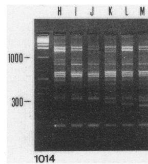
FIG. 2. PCR-mediated DNA typing of MRSA strains. With primer 1014 (see Table 1), six different genotypes, marked H to M, were identified in a group of 48 MRSA strains. The lengths of two of the molecular size markers (1-kb ladder; GIBCO-BRL) are indicated on the left, in base pairs.