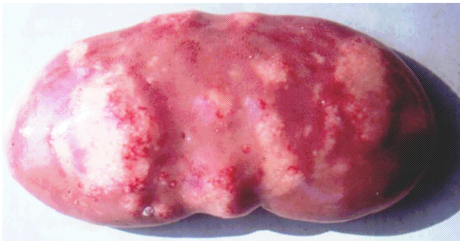
Figure 2. Kidney with neoplastic tissue (fibroadenoma) - spontaneous case of MPN in Bulgaria.

All feed samples originating from farms with high frequency of spontaneous avian nephropathy in Bulgaria were also positive for OTA and similarly to pig farms, the levels of OTA were substantially low (the values ranged from 90.8 to 310 ng/g (mean 196.2 ng/g \pm 45.9). The nephropathy in chickens was usually observed during the spring and summer, similarly to porcine nephropathy and in the same regions as well. The occurrence of nephropathy in different batches of slaughtered chickens varied from 1-2 per cent up to 90-100 per cent. The continuance of this nephropathy, also differed widely from one month to about 5-6 months or even throughout a year [23].