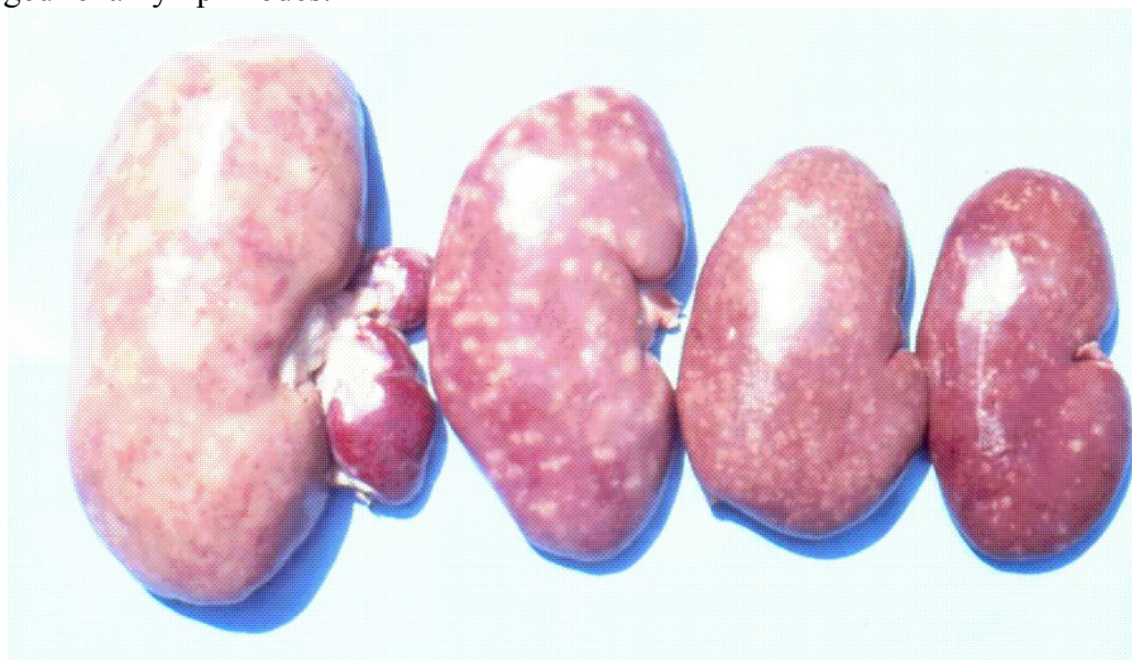
Figure 1. Range of enlargement and mottled or pale appearance of kidneys from pigs with MPN at age of 6-8 months taken at slaughtered time, including an example (left) with enlarged renal lymph nodes.

It is important to mention that kidney damages in spontaneous MPN in Bulgaria (Figure 1) are more similar to those in Balkan endemic nephropathy (BEN) in humans, than in Danish MPN. For example, the fibrotic changes and contraction of kidneys in the end-stages of MPN in Bulgaria are very comparable to those in BEN in humans [1], whereas such changes are not seen in the classical description of MPN as made in Denmark. In addition to the contraction of kidneys in later stages of Bulgarian MPN and BEN, there are various other similarities between BEN in humans and Bulgarian MPN as the low contamination levels of OTA in feeds or foods and serum, neoplastic changes in kidneys (pigs – Figure 2) or urinary tract (humans), retention cyst formation in proximal tubules of kidneys, vascular lesions in kidneys, electron dense formations and myelin-like figures in mitochondria of epithelial cells (Figure 3). However, these pathological changes have not been observed in classical MPN as described in Denmark or elsewhere. This circumstance, in addition to low feed/food levels of OTA in Bulgarian MPN and BEN, suggest a possible interaction between OTA