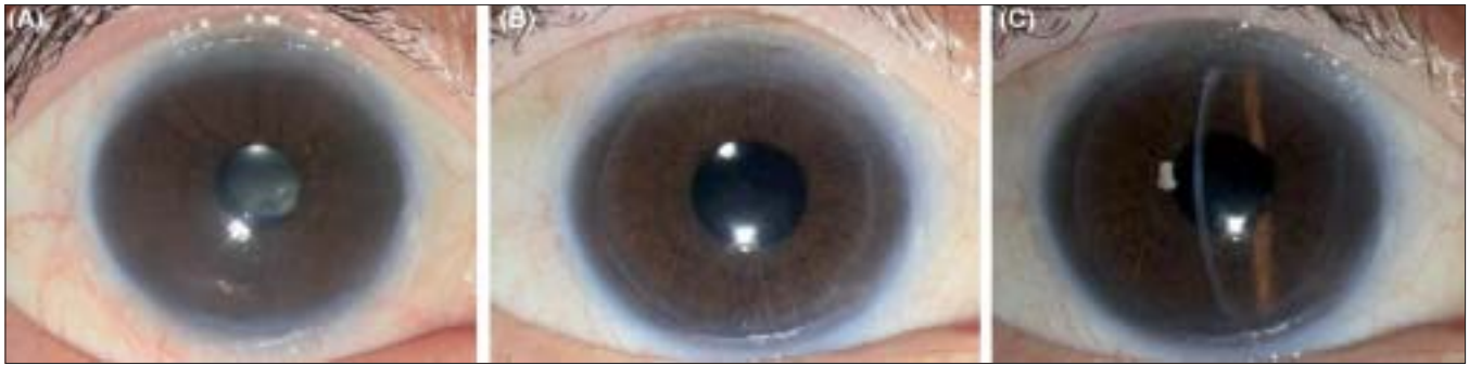
Figure 1: A-C Descemet stripping endothelial keratoplasty in early pseudophakic bullous keratopathy. (A) Preoperative. (B) Postoperative after three months (diffuse illumination). (C) Postoperative after three months (slit-beam illumination)