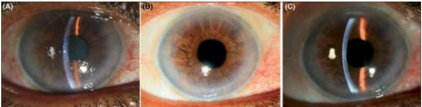
Figure 3: A-C Combined Descemet stripping endothelial keratoplasty and manual small incision cataract surgery with posterior chamber intraocular lens implantation in severe Fuchs' dystrophy with cataract. (A) Preoperative. (B) Postoperative after three months (diffuse illumination). (C) Postoperative after three months (slit-beam illumination)

the most preferred type of posterior lamellar keratoplasty in recent times. It allows selective replacement of diseased host endothelium with a suitable and healthy donor posterior lamella. The major advantage of posterior lamellar or endothelial keratoplasty procedure in comparison to PK is that the normal corneal surface of the recipient is retained because of the avoidance of surface corneal incisions and sutures. 3-5,10 This surgery may be manual (DSEK), automated (DSAEK) or Femto-second laser assisted (FS-DSEK) depending upon the method of preparation of the posterior lamellar donor lenticule. 8,11 Among these, manual dissection in DSEK is the least expensive and may be the more appropriate procedure in the Indian scenario.