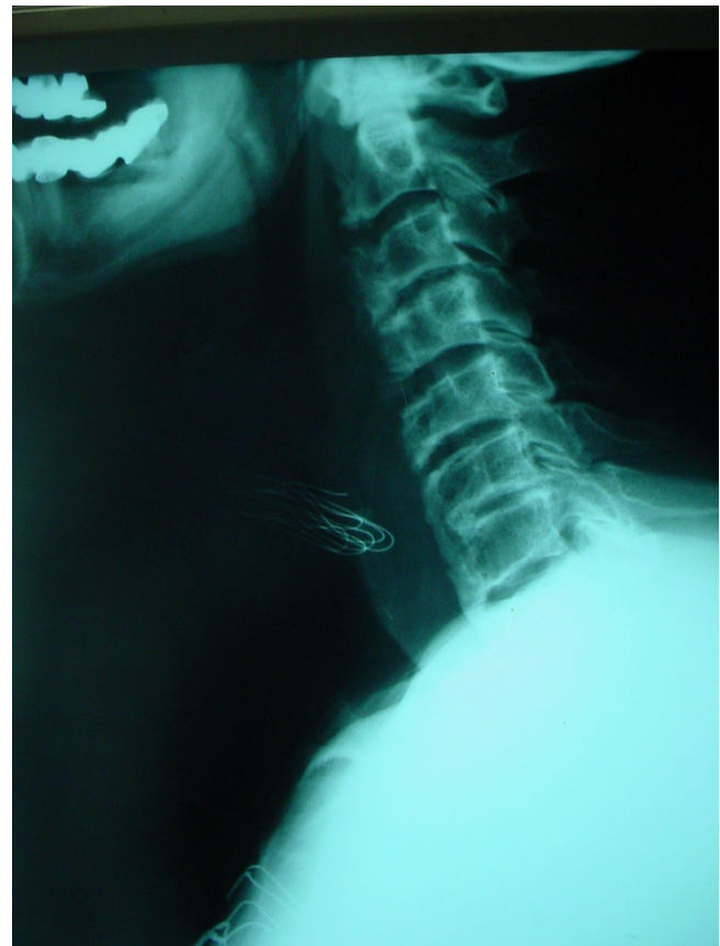
Figure 3 Postoperative lateral cervical spine x-rays showed absence of the osteophytes and normalization of the normal structure.

Evaluation of patients with progressive dysphagia should include routine otolaryngologic examination, cervical spine films, cervical MRI and video fluoroscopic swallowing study. On examination, the trachea may be displaced from the midline with a hard palpable mass between the soft tissue of the sternocleidomastoid laterally, and the trachea and esophagus medially [14]. Although some clinicians have recommended endoscopy, this may in fact prove dangerous and has been a common cause of esophageal perforation [15]. Differential diagnosis