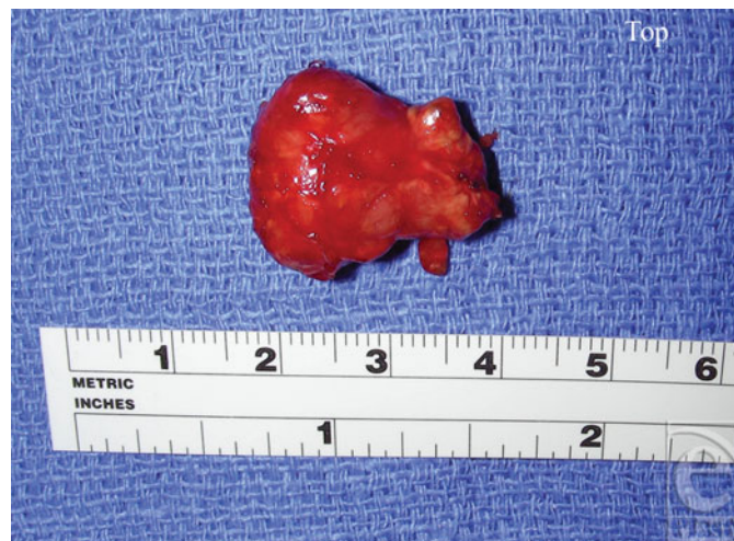
Figure 3. The removed mass.