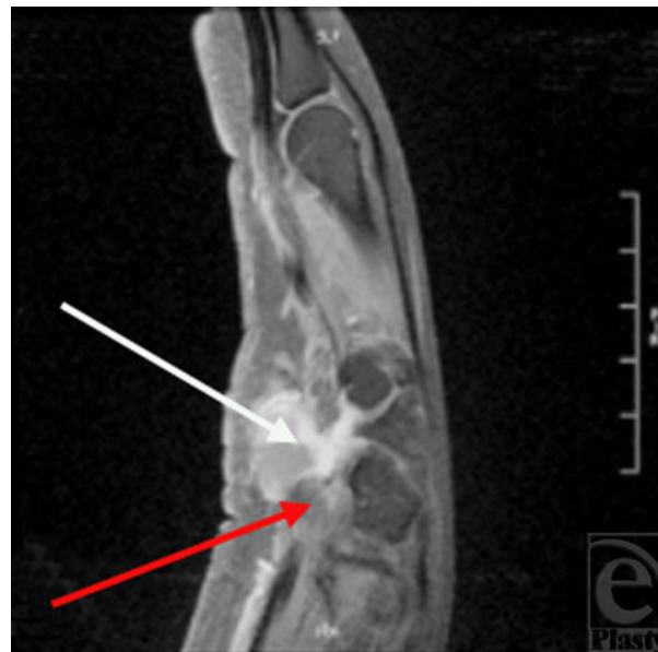
Figure 1. Sagittal T1-weighted magnetic resonance image of the right hand showing a giant cell tumor of tendon sheath involving the ulnar neurovascular bundle at Guyon's canal. The red arrow indicates the ulnar neurovascular bundle. The white arrow indicates the mass.

In the operating room under general anesthesia, a 5-cm Brunner's incision was made directly over Guyon's canal. It extended 3.5 cm distal and 1.5 cm proximal to the wrist crease. The mass was identified and was found to originate at the distal portion of Guyon's canal,