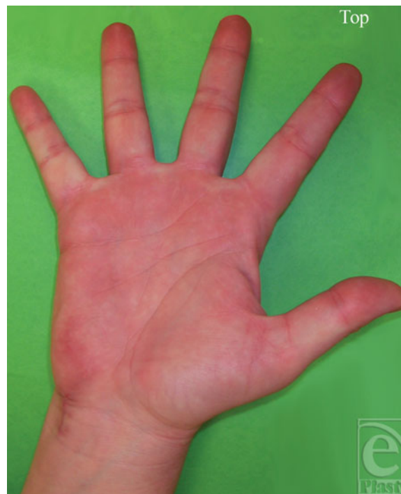
Figure 4. The patient's hand postoperatively.

difference being that GCTTS grows outward from the tendon sheath, whereas pigmented villonodular synovitis grows inward from the synovial lining into the joint. There are 3 main cell types that compose GCTTS; these are multinucleated, osteoclast-like giant cells, round or polygonal mononuclear cells, and histiocyte-like cells (foam cells). 14 All of these cells contain hemosiderin in their cytoplasm. 3 Gross observation shows lesions that can be