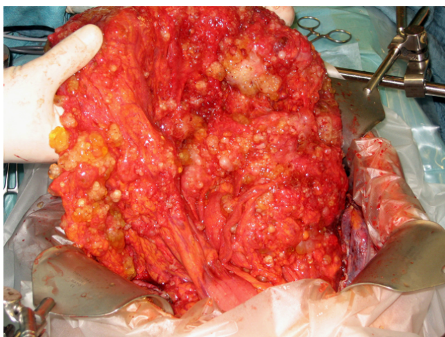
Figure 1 'Omental cake' in a patient with peritoneal carcinomatosis arising from appendiceal cancer.

CRS consists of numerous surgical procedures depending on the extent of peritoneal tumor manifestation. In appendiceal malignancies, the omental cake, a disseminated tumor infiltration of the greater omentum, represents the most affected abdominal area (Fig. 1). Surgery may include parietal and visceral peritonectomy, greater omentectomy, splenectomy, cholecystectomy, resection of liver capsule, small bowel resection, colonic and rectal resection, (subtotal) gastrectomy, lesser omentectomy, pancreatic resection, hysterectomy, ovariectomy and urine bladder resection. In patients with mucinous tumors and infiltration of the umbilicus, an omphalectomy is necessary. Extraperitoneal dissection may enable the anterior parietal peritonectomy and avoid a tumor contamination of the abdominal wall (Fig. 2). The extent of intraperitoneal tumor manifestation is determined using the peritoneal cancer index (PCI), a combined numerical score of lesion size (LS-0 to LS-3) and tumor localization (region 0–12) [13,14]. The aim of CRS is to