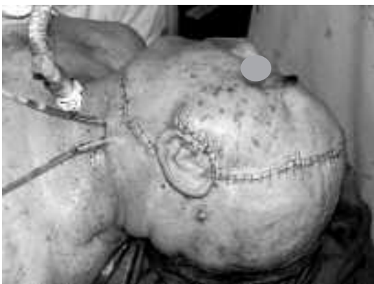
Fig. 6. Monitor skin island of rectus abdominis free flap sutured outside between cervical flaps.