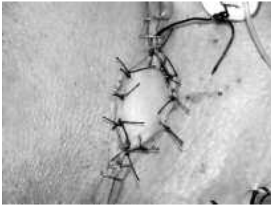
Fig. 3. Monitor island sutured outside between skin incision.

artery; the cephalic vein was directly sutured to the internal jugular vein with termino-lateral anastomosis in all cases. The monitoring skin paddle was sutured externally between the cervical flaps allowing the physician and nurses to regularly check flap viability and detect early changes in skin perfusion (Fig. 3).