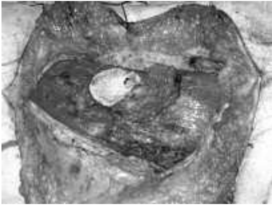
Fig. 5. Rectus abdominis left muscle with skin island harvested just above it in periumbelical region.