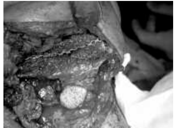
Fig. 4. Free osseous fibula flap in its definitive position, with the 2x2cm monitor skin island centered just above the septo-muscular branch including a protective cuff of muscle ( flexor allucis longus muscle) around the bone.

One patient underwent wide excision of a Malignant Peripheral Neural Sheet Tumour (MPNST), in the temporal region and deep into the infra-temporal fos-